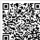
Little Malaysia UK