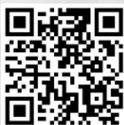
Ellron Consulting Services