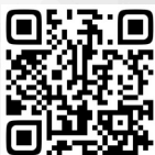
Sondot Petcamp Penampang